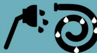
SOFT SPRAY WAND